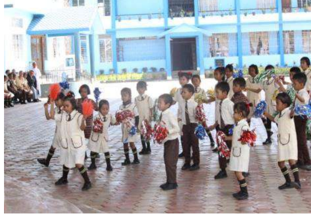
Thus, the day ended with few games.