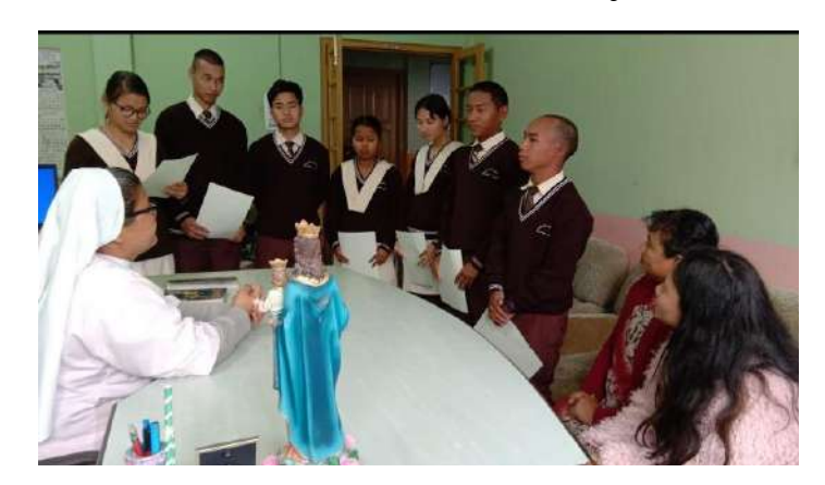
Page 38 of 43