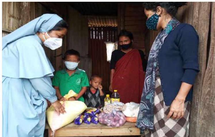
Providing food grains tp PWD's supported by PRATYek-MINEISNINE