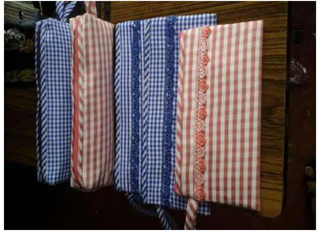
Exhibition & sale of product from vocational training centre